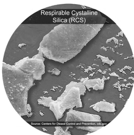
Silica dust ranges in size and is characterized by its jagged crystalline form.

Particulate matter of ≤10µm (PM10) is the approximate size threshold for particles to be able to penetrate the body's natural defences (mucus membranes, cilia, etc.) and reach deep into the lungs, potentially causing serious health issues such as silicosis.